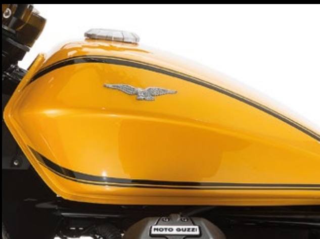
STEEL TANK WITH EMBOSSED EAGLE