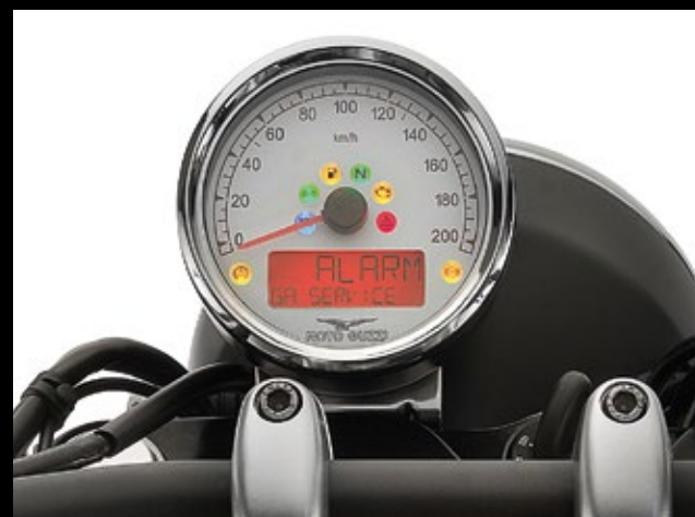
ANALOGUE INSTRUMENTATION WITH LCD DISPLAY