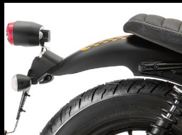
SHORT REAR MUDGUARD