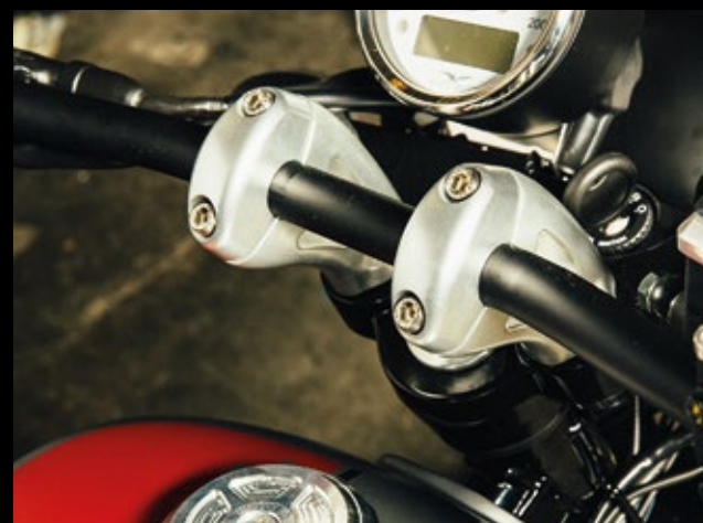
MATT BLACK DRAGBAR HANDLEBAR