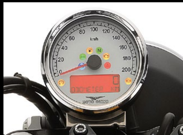
ANALOGUE INSTRUMENTATION WITH LCD DISPLAY