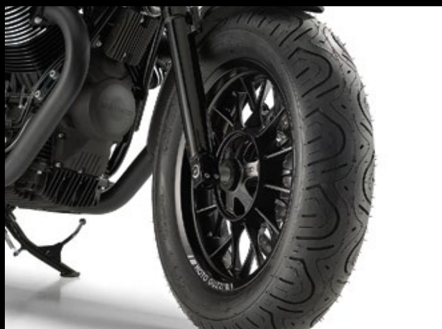
130/90 FRONT TYRE