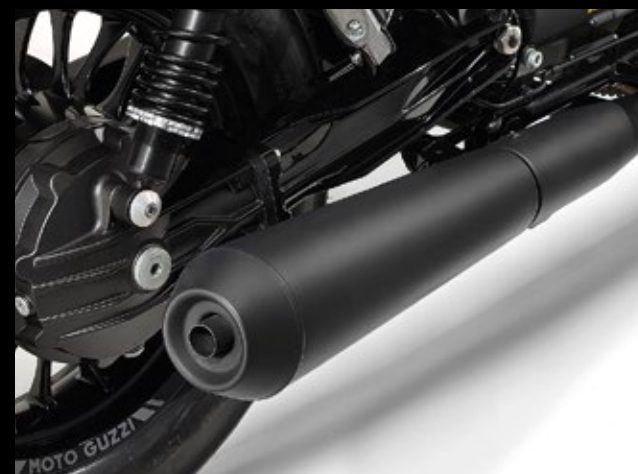
BRUSHED BLACK EXHAUST