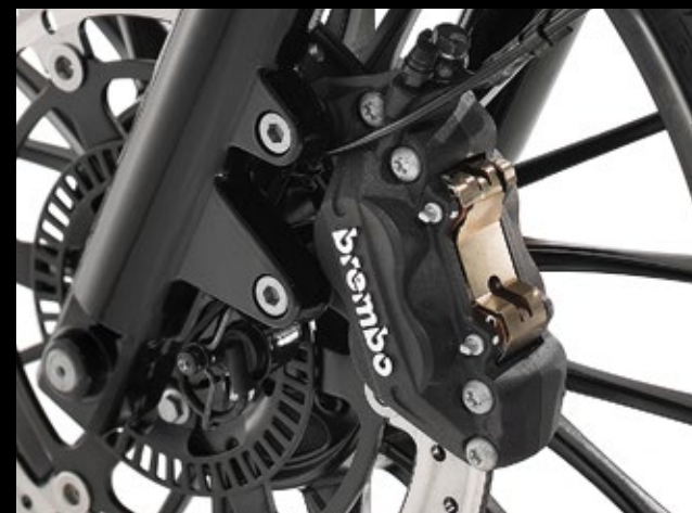
BREMBO 4 PISTON FRONT CALIPER