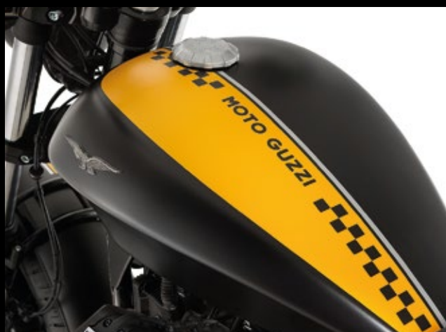
MATT FINISH STEEL TANK