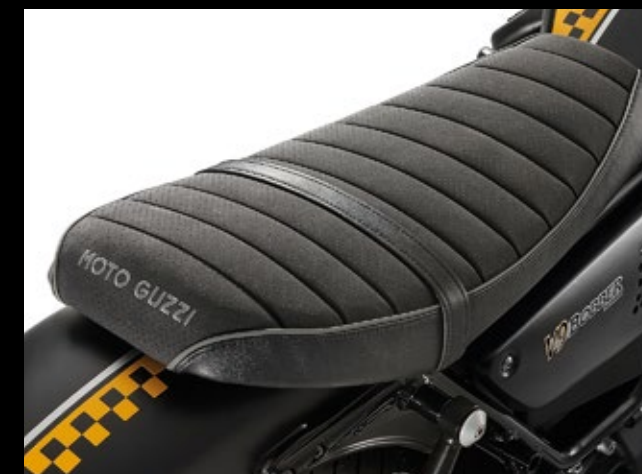
SLEEK SPORTS SADDLE